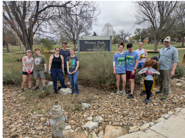
Wooten - It's My Park Day Event

Be sure to check out the photos from the day and keep an eye out for the next opportunity to pitch in this fall!