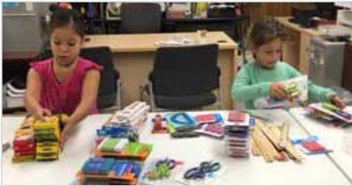
Just a sample of the supplies neighbors donated